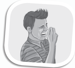
4 a _____ joke