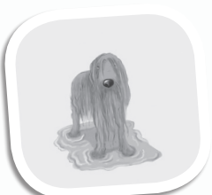
5 a _____ dog