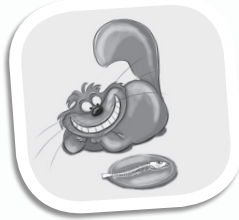
8 a _____ cat