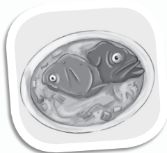
1 a disgusting meal

ancient awful delighted disgusting furious hilarious massive packed soaking tiny