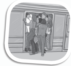
7 a _____ train