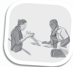
9 a _____ customer