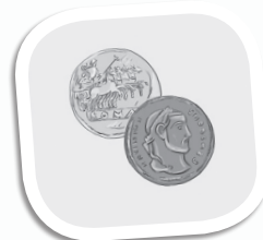
6 _____ coins