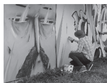
3 street artist