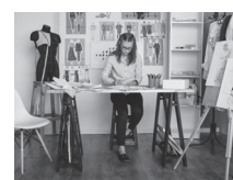
2 fashion designer