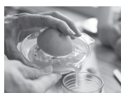
1 p re ss