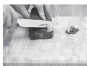
5 re mov e