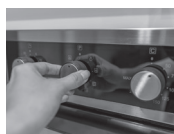
4 inc rea se