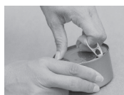
3 p ul l