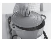
6 co ver