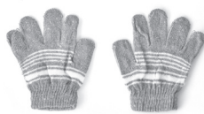
6 g l o v e s