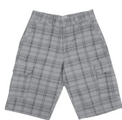
4 s h o r t s