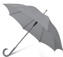
3 u m b r e l l a