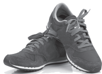
8 t r a i n e r s