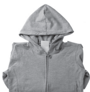
2 h o o d i e