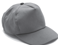
7 c a p