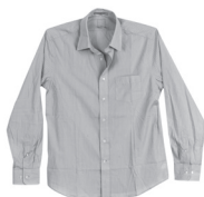
5 s h i r t