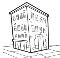
2 historic building