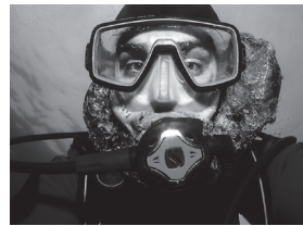
1 diving instructor

diving instructor city garden camper van painter photographer