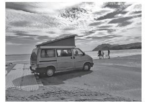
2 camper van