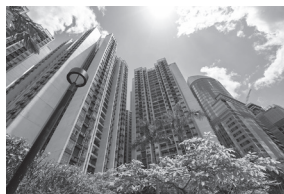
1 apartment block

apartment block cinema park rooftops shopping centre supermarket