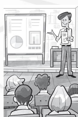
10 give a presentation

1 Look at the pictures and complete the school activities with the verbs in the box.