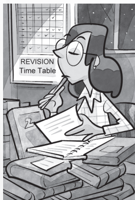
1 revise for an exam