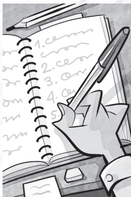
2 copy notes