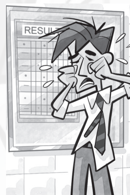
5 fail an exam