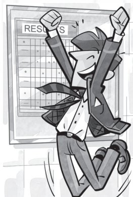
6 pass an exam