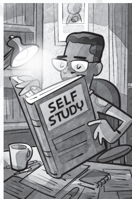
8 make self-study