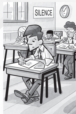
4 take an exam