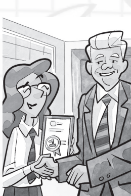
7 receive a prize