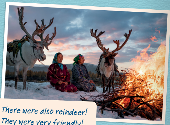
There were also reindeer! They were very friendly!