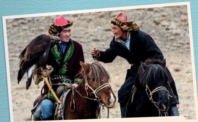
The Altai Mountains were beautiful. There were lots of animals, like eagles and horses at the Golden eagle competition. Everyone had a good time.