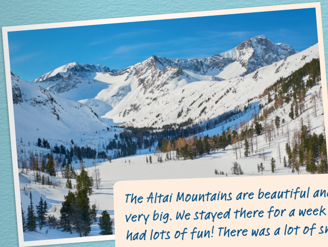
The Altai Mountains are beautiful and very big. We stayed there for a week and had lots of fun! There was a lot of snow!